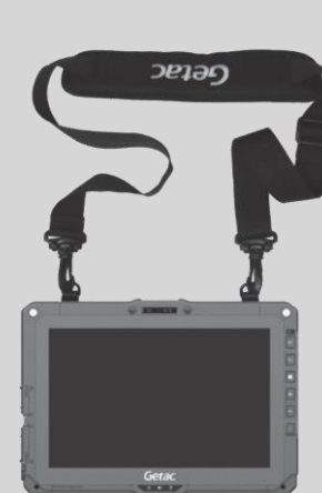
Attaching to the Tablet