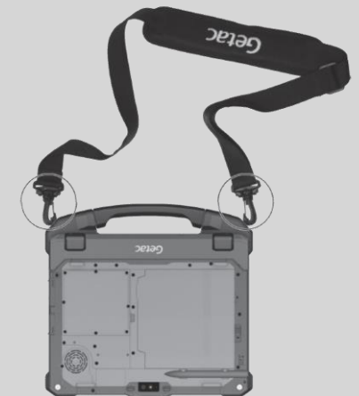
Attaching to the Detachable Keyboard